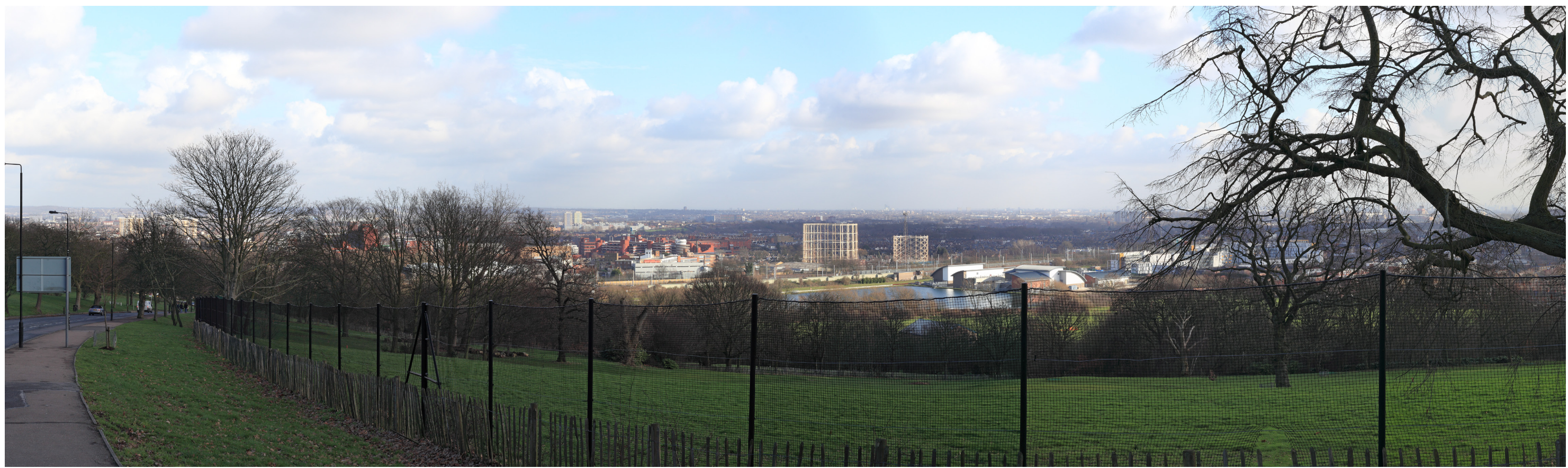
Photoviewpoint 11 Existing : View east from Alexandra Palace Way looking across the slopes of Alexandra Park towards Hornsey Water Works, the railway corridor and Site beyond. New River Village is also visible to the right of view.